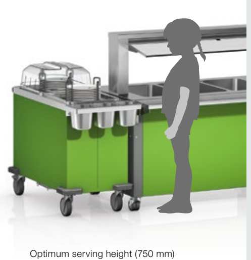
for children of up to 10 years of age

Extra small: a child-friendly serving system such as BASIC LINE Kids is adapted to children's height with lower serving system modules. There are now two unheated BLANCO plate dispensers in a time-tested design, with a serving height of 750 mm: