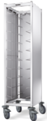
TAW 10 GN with panelling on 3 sides, stainless steel