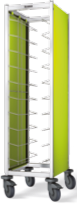
TAW 10 GN with panelling on 2 sides, colour: lime