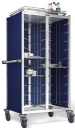
TAW 2 x 10 GN with stainless-steel trolley top, all-round railing and push handle (shown with accessories)