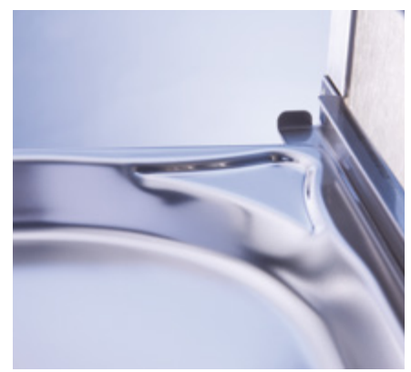
Also safe during transport The push-through protection is mounted on both sides and thus ensures safe transport in every direction.