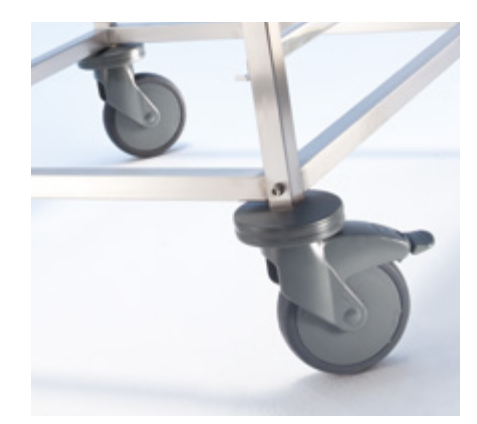
Bumper rail fitted as standard All shelf trolleys are equipped with a strong bumper rail. They protect the trolley and inventory against damage.