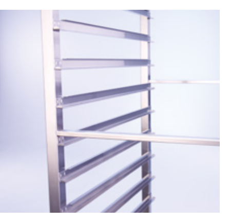
Connected crosswise Cross struts increase the overall stability. Thanks to their offset arrangement, they can also be used as support rails.