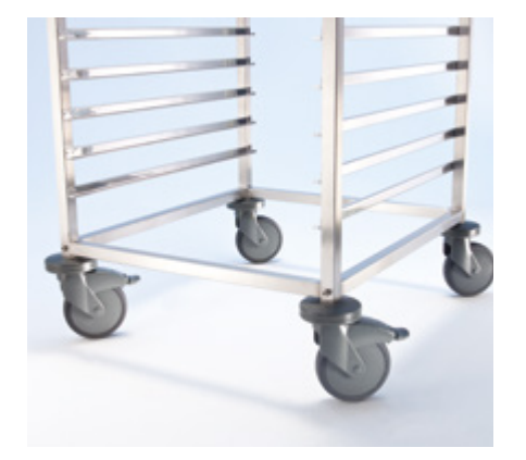
All-round stability The robust, all-round base frame adds extra stability while also protecting the support rail against deformation.

B.PRO shelf trolleys: long operating life featured as standard.