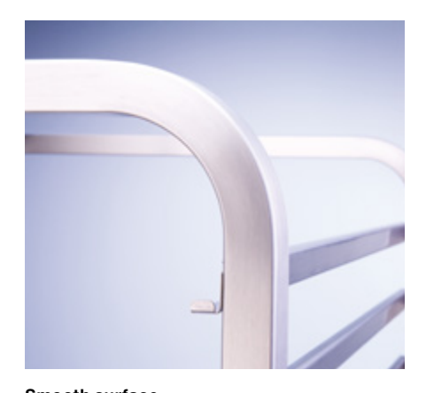
Smooth surface Tube clamps without tapering. This not only guarantees a beautiful, functional design but also maximum hygiene since there are no edges collecting dirt.