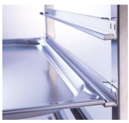
Safety first The special U-profile of the support rails acts as an integrated tip safety device.